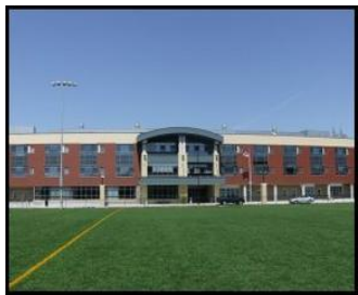
Auburn High School