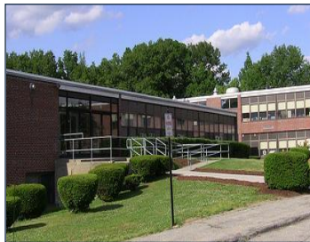
Swanson Road Intermediate School